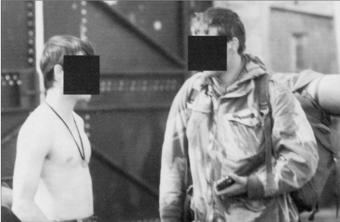
Strabane, Northern Ireland. Myself and a colleague chatting inside our base just prior to attending a debrief on the activities of a twenty-four-hour observation we had been on the previous day. The roll carried in my Bergen (backpack) helps to insulate the body from the ground.