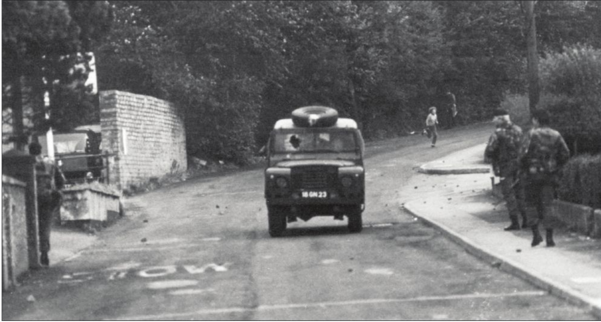
Patrolling Strabane, Northern Ireland. This Land-Rover had been called out to assist us disperse a small crowd of teenagers who had been throwing bricks at our patrol. As can be seen, the windscreen took a missile before the metal grille could be raised. Note the number of bricks strewn in the road.