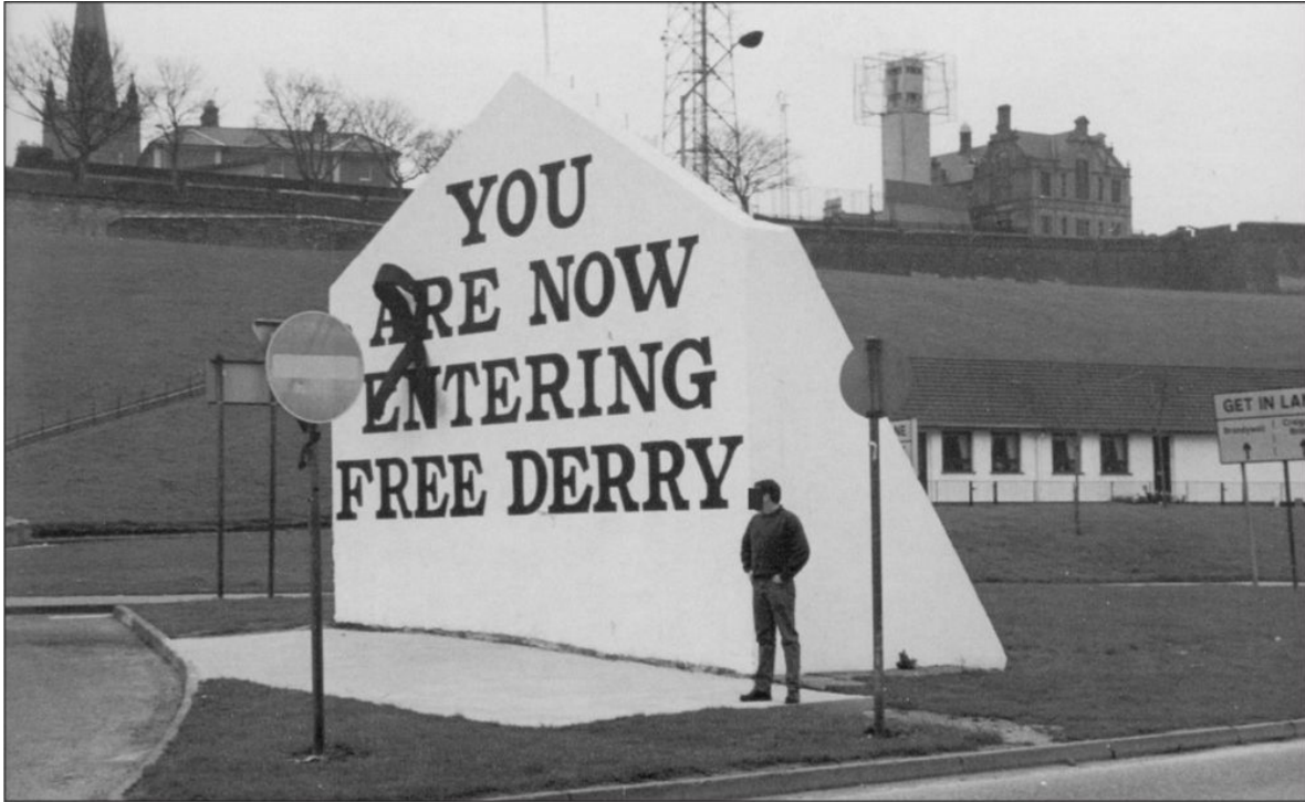
Londonderry, Northern Ireland. The infamous 'Free Derry' wall. Once the end of a row of houses, it is located in the middle of a busy dual-carriageway on Rossville Street, scene of 'Bloody Sunday'. Note the army sangar in the background, which is heavily fortified against rocket and grenade attacks.