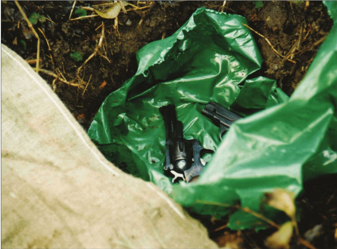
This particular hide contained two handguns, a revolver and a semi-automatic pistol, which had been covered to maintain their working order.