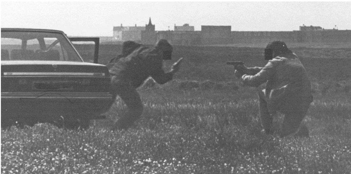
Myself and a fellow student on the FRU course at Ashford practising vehicle-extraction drills. I am covering him away using a Browning 9mm pistol, the standard personal weapon for all covert operators.