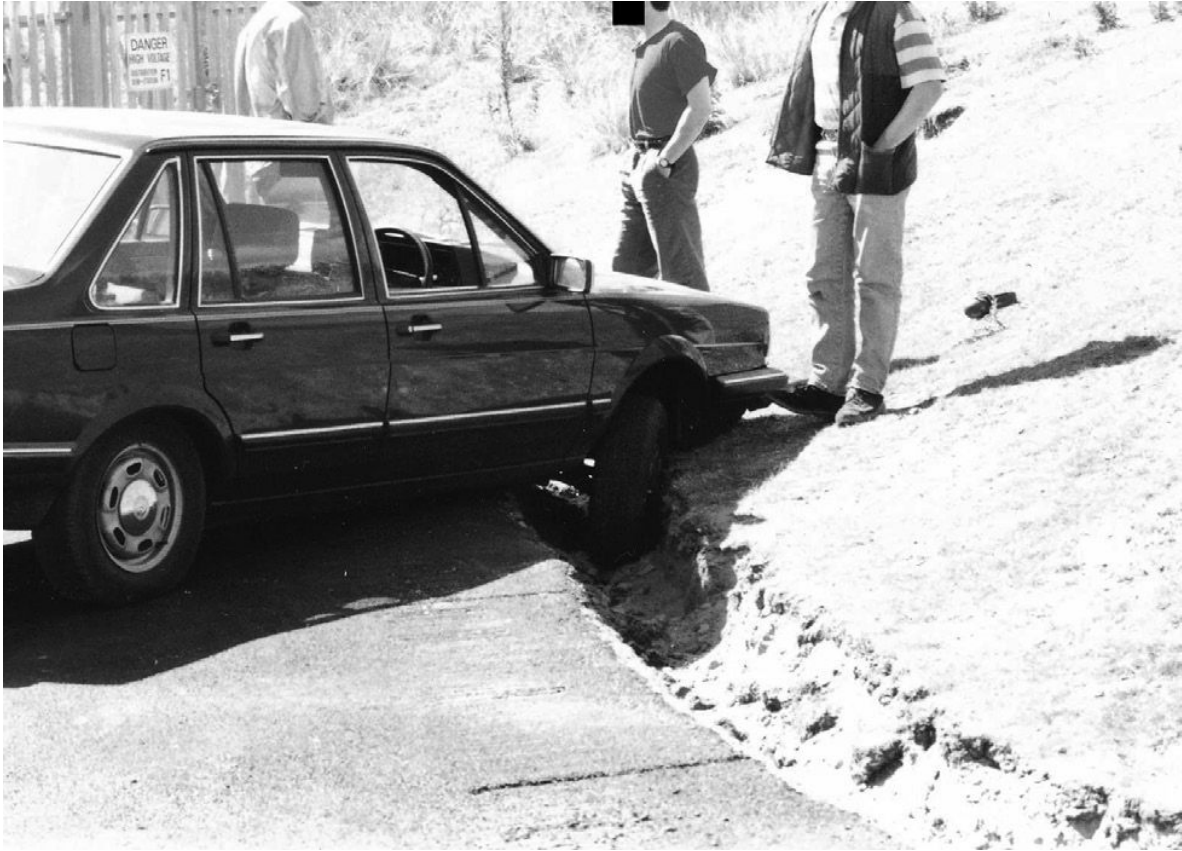
The result of some over-enthusiastic car drills.