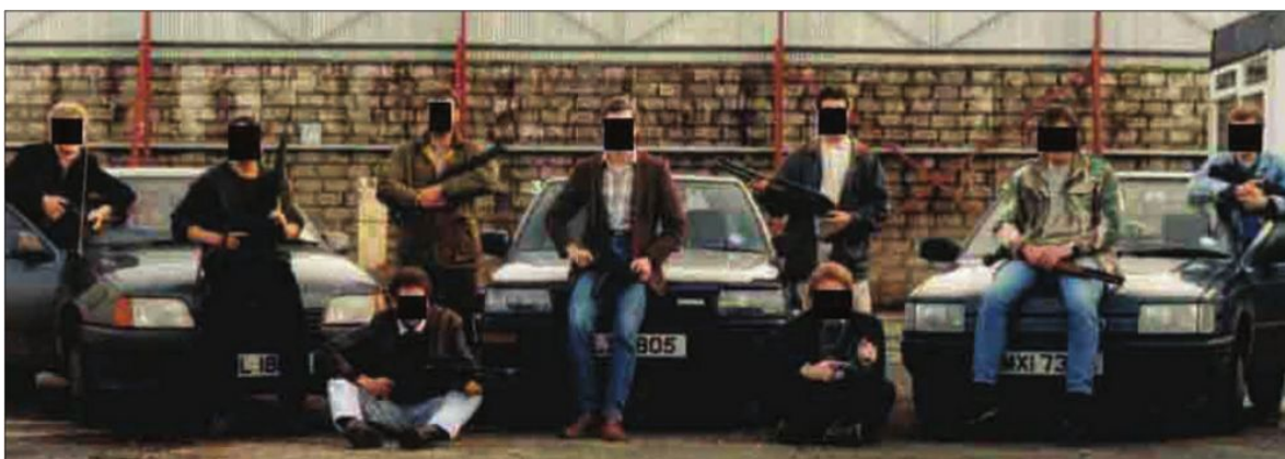
The detachment when I first arrived all looked very gung-ho with an assortment of weapons on show, including, Heckler & Kochs, a general purpose machine gun and pump-action shotguns.