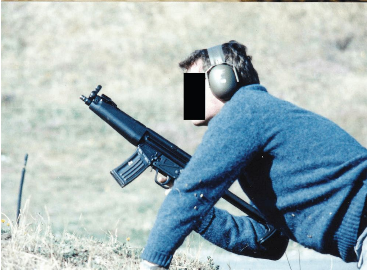
CQB training, Northern Ireland.