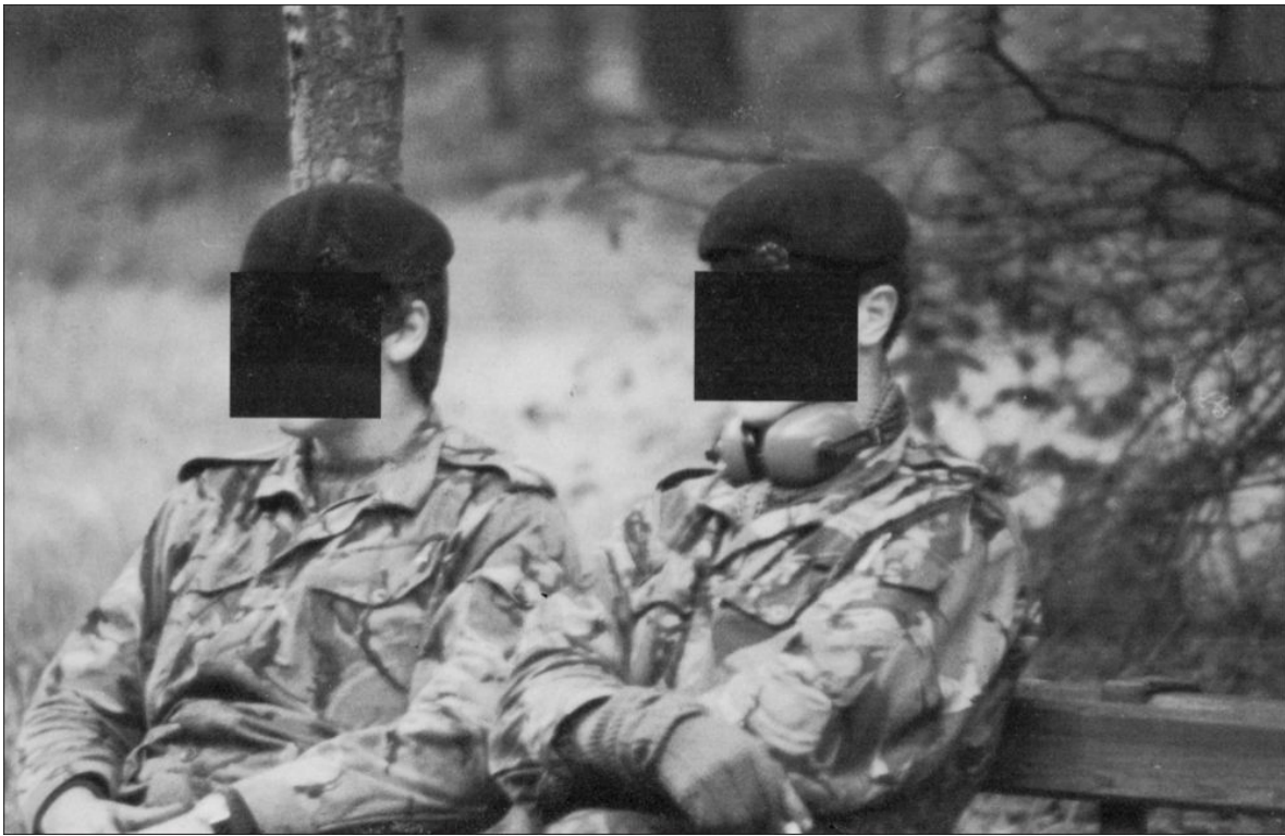
Sennelager, Germany. Myself and a colleague take a well-earned break during the training. Note at this stage that our padded gloves were not issued, army socks do the trick just as well.