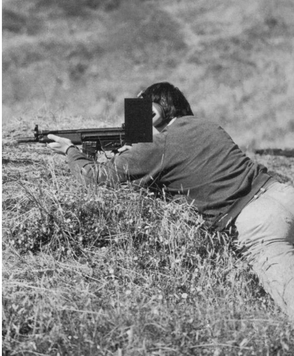
Personal weapons training, Northern Ireland. The weapon is a Heckler & Koch machine pistol.