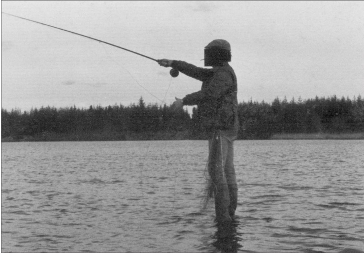
The gentle surface ripple on a mountain lough. The perfect end to the perfect day on Lough Navar, Co. Fermanagh.