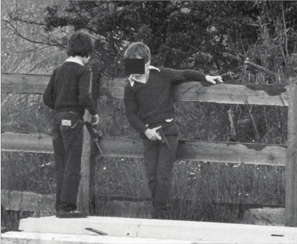
Strabane, Northern Ireland. These two children were playing in a field near to the notorious Head of Town estate. Unfortunately, the likelihood is that they progressed to carrying real weapons.