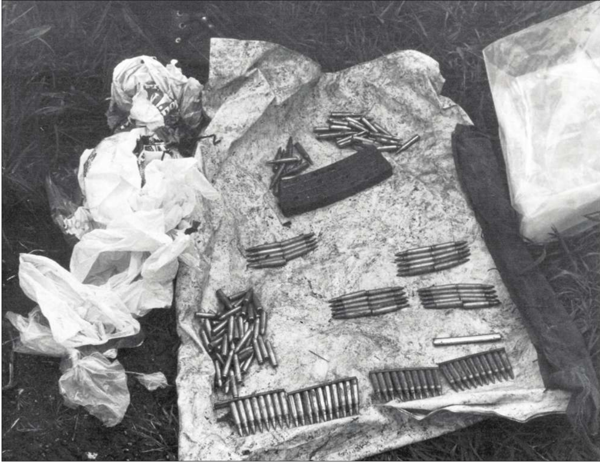
Omagh, Northern Ireland. This assortment of ammunition, clips and the magazine were found alongside the two weapons in the previous photo. They were covered by a plastic fertiliser bag for waterproofing.