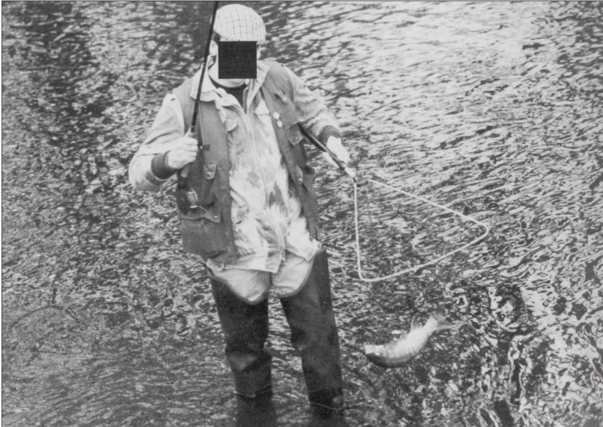
Northern Ireland. Not all the activities in the Province are terrorist orientated. Fishing was my escape from my role in the detachment.