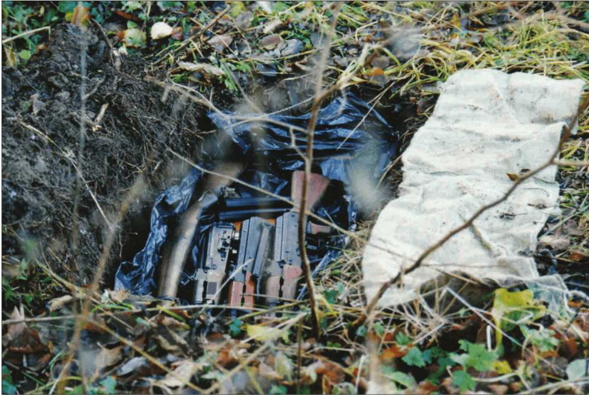
Another terrorist weapons cache, this one containing a bolt-action rifle and three assault rifles.