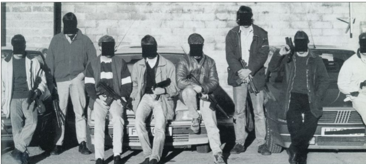
FRU detachment, Co. Fermanagh. The detachment line-up just prior to my departure from the unit. The faces have all changed but the weaponry and firepower remain the same.