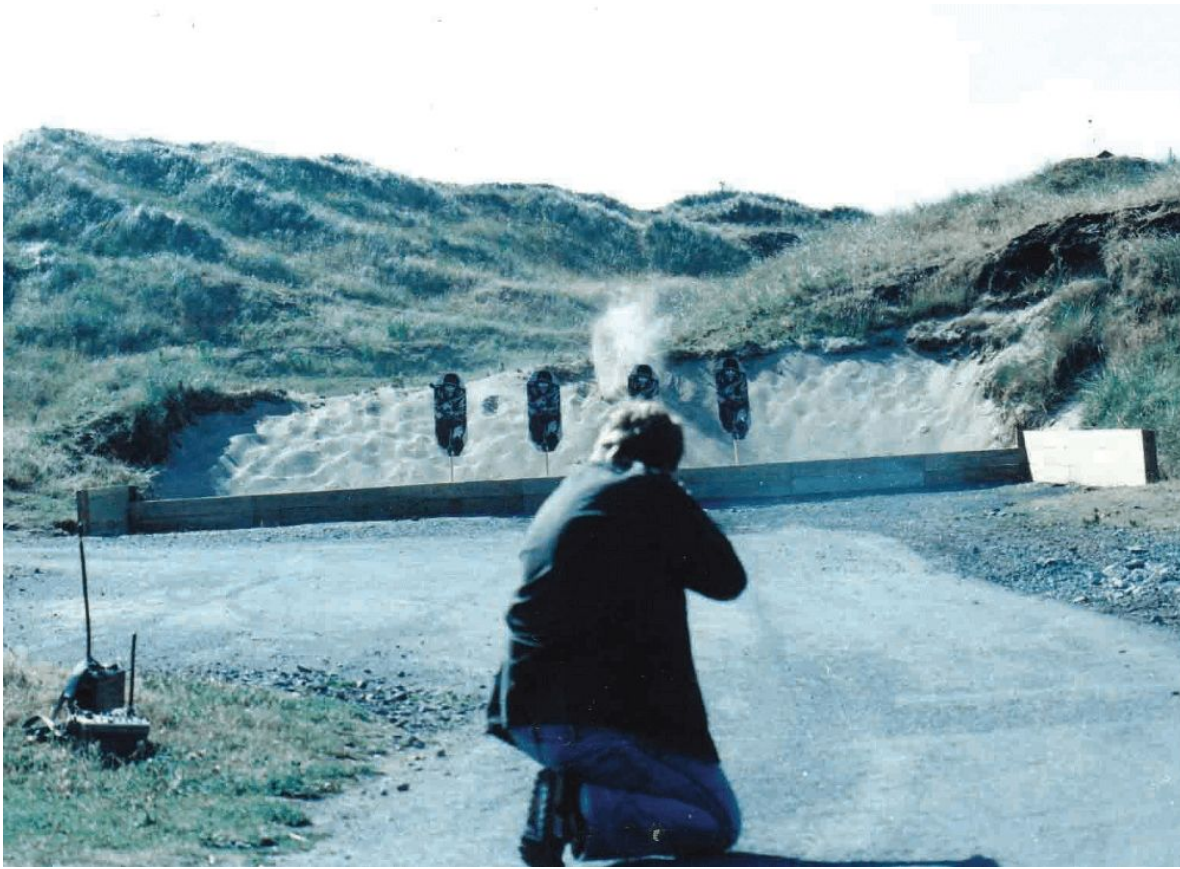
A range training day in Northern Ireland.