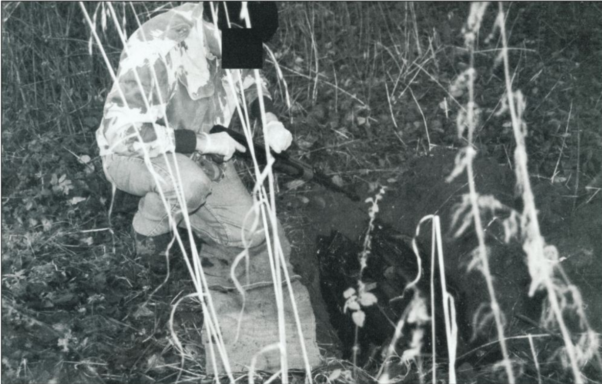
Clearing and checking a weapon contained in a terrorist cache. This particular weapon is a derivative of the Kalashnikov AK series and was in perfect working condition. Note the hessian sacks laid for lessening ground sign and the medical gloves for weapon handling.