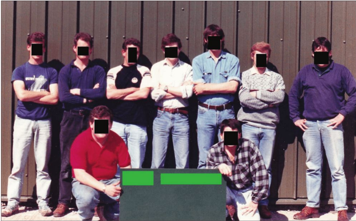
The detachment – note the complete absence of any military uniform or equipment.