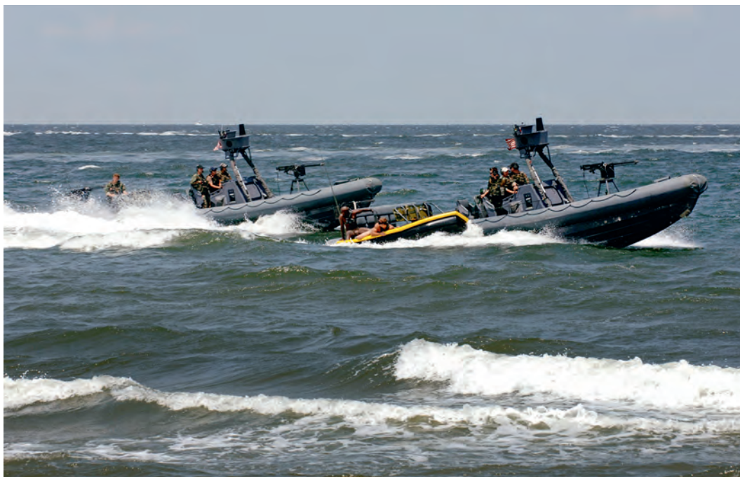
Rigid-Hulled Inflatable Boats (RHIBs) in action.