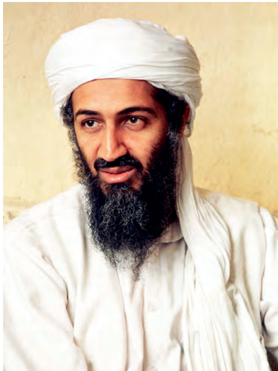
Osama bin Laden.