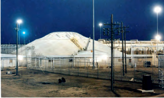
A Gravel Gertie ammunition storage facility.