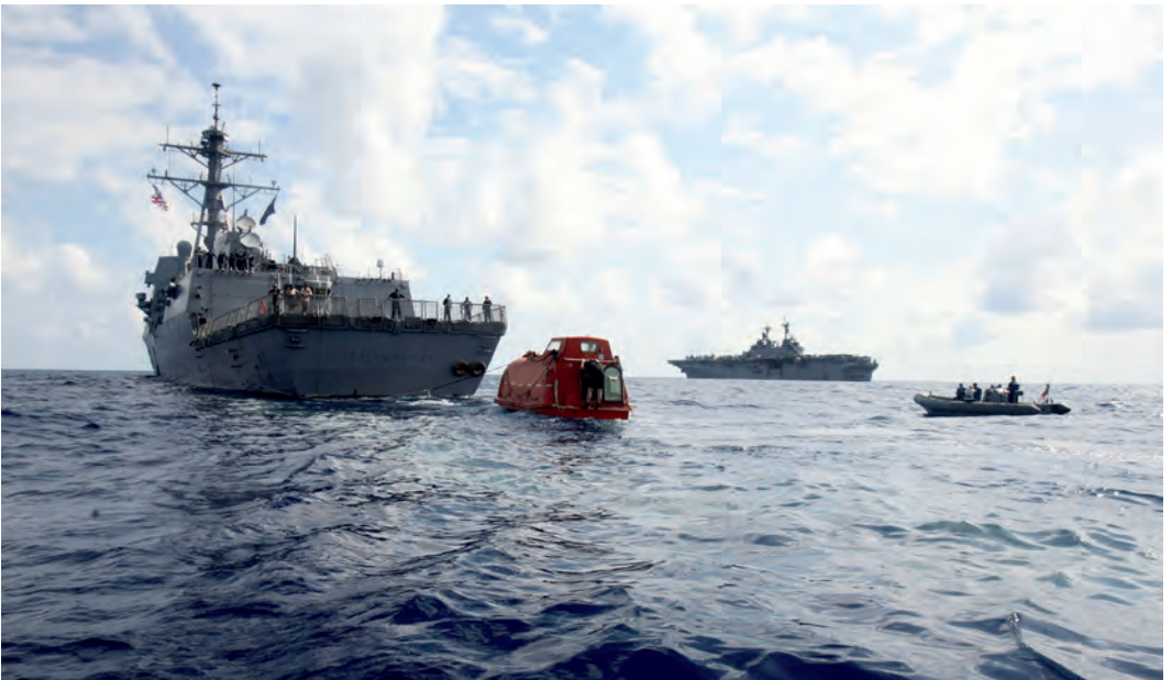
The lifeboat that held Captain Richard Phillips. Indian Ocean; April 2009.