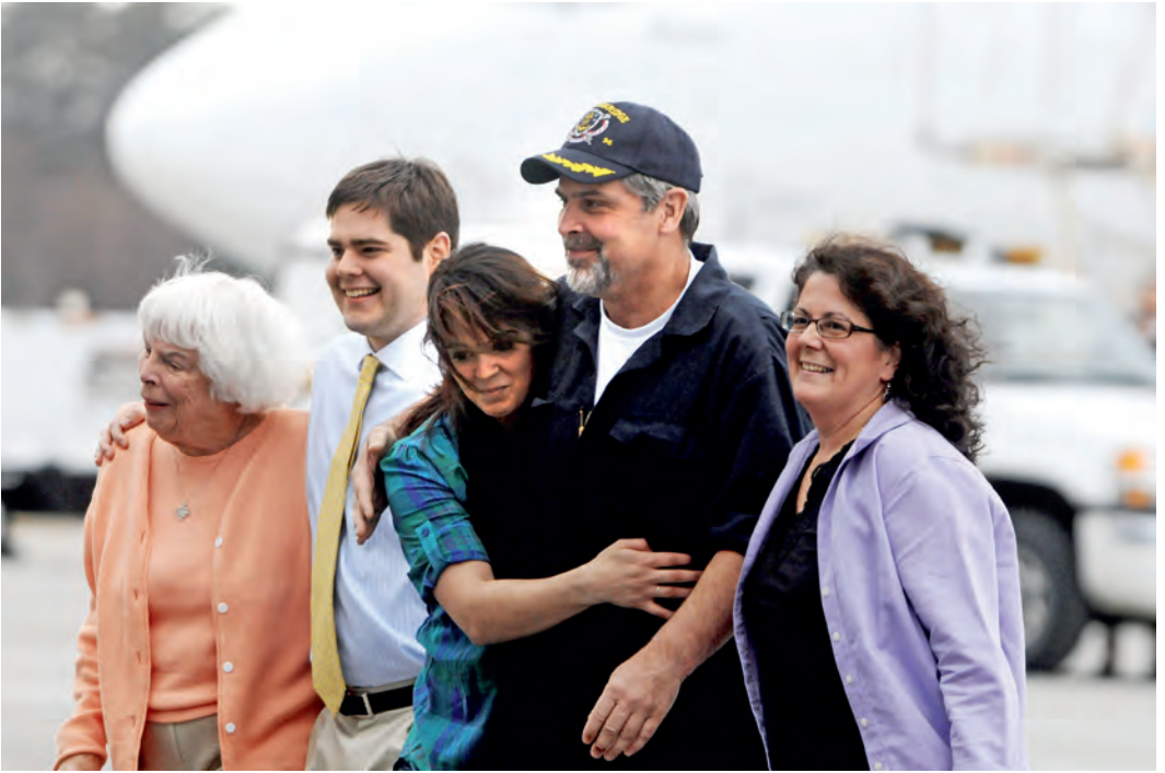
Captain Richard Phillips after the SEAL rescue.