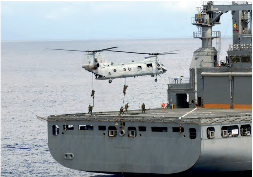
Fast-roping onto a moving ship.