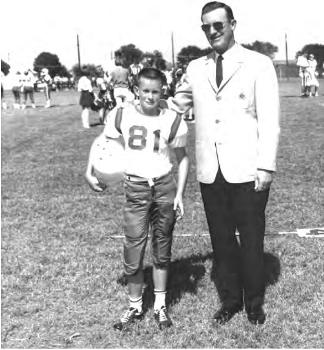
Football was a way of life in Texas. With my dad in San Antonio, Texas; 1966.