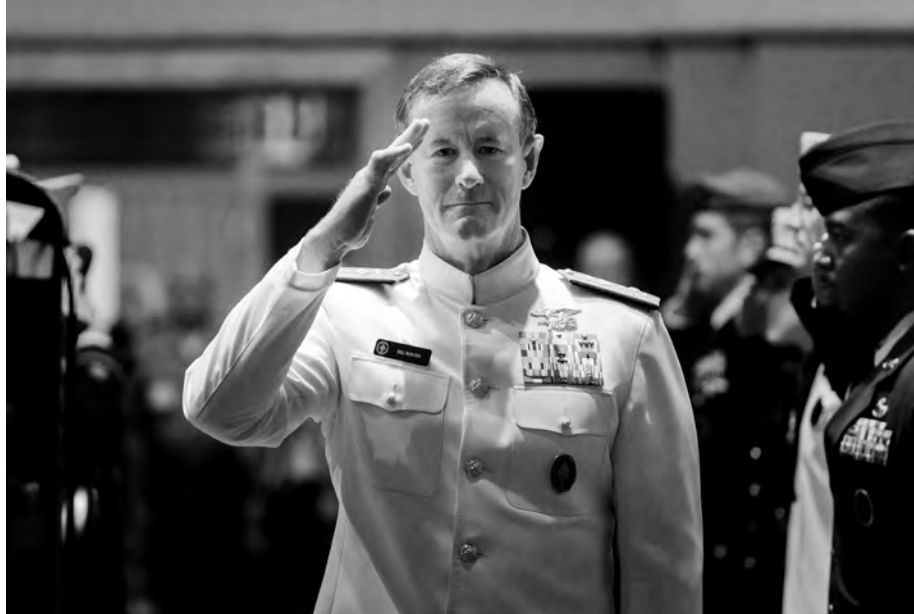
My final salute. Tampa, Florida; August 2014.