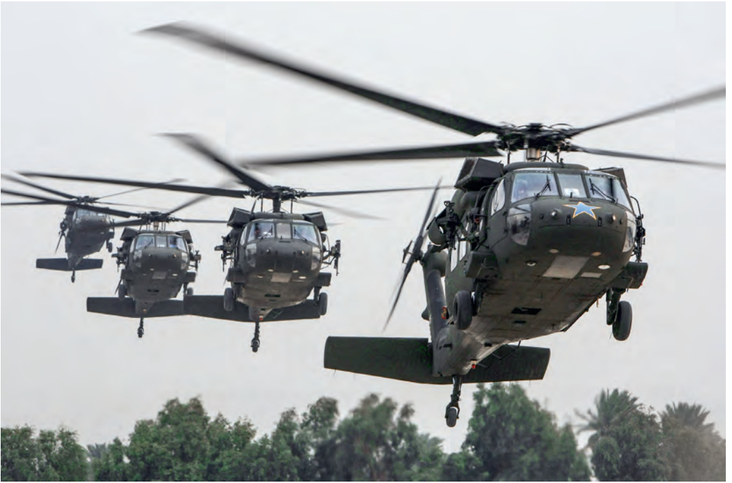
MH-60 Black Hawks in action.