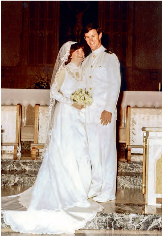
Our wedding was the start of a 41-year love story. Dallas, Texas; May 6, 1978.