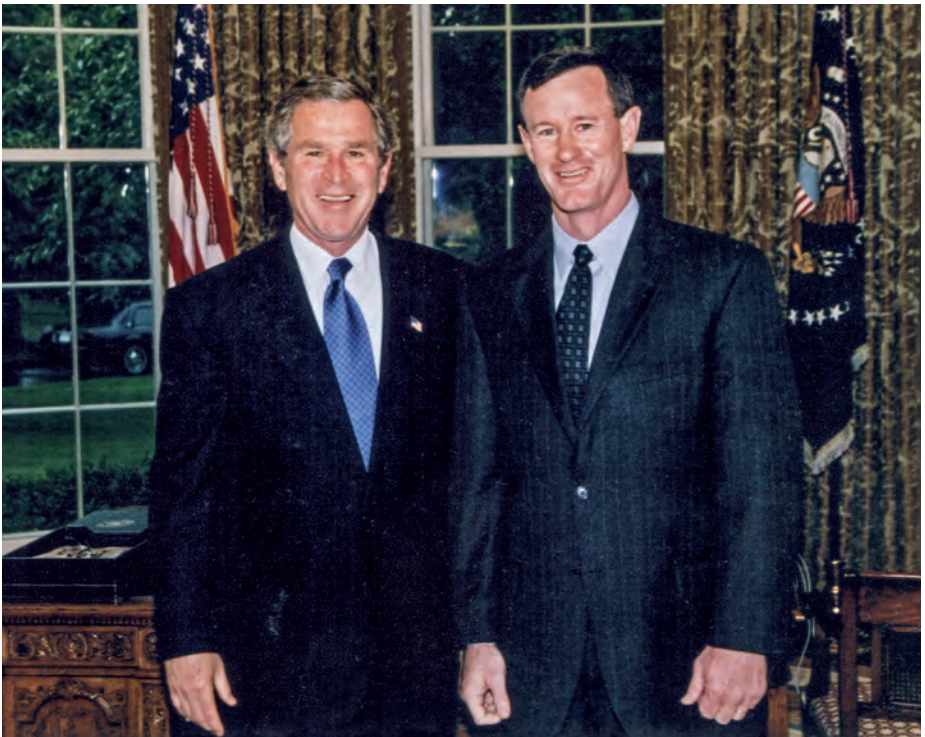
I had the honor of working in the Bush 43 White House after 9/11. Washington, DC; 2003.