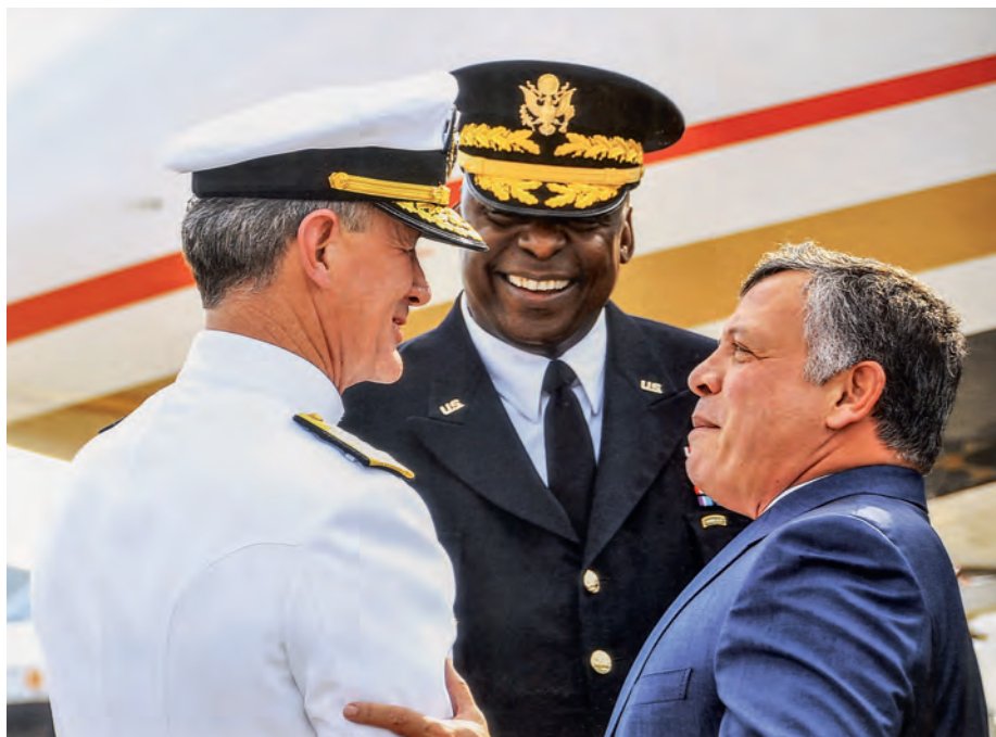
As the SOCOM Commander, I'm sharing a laugh with General Lloyd Austin and King Abdullah II of Jordan. Tampa, Florida; 2013.