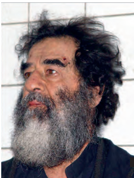
The Ace of Spades, Saddam Hussein, after his capture by Army Special Operations forces. Baghdad, Iraq; December 2003.