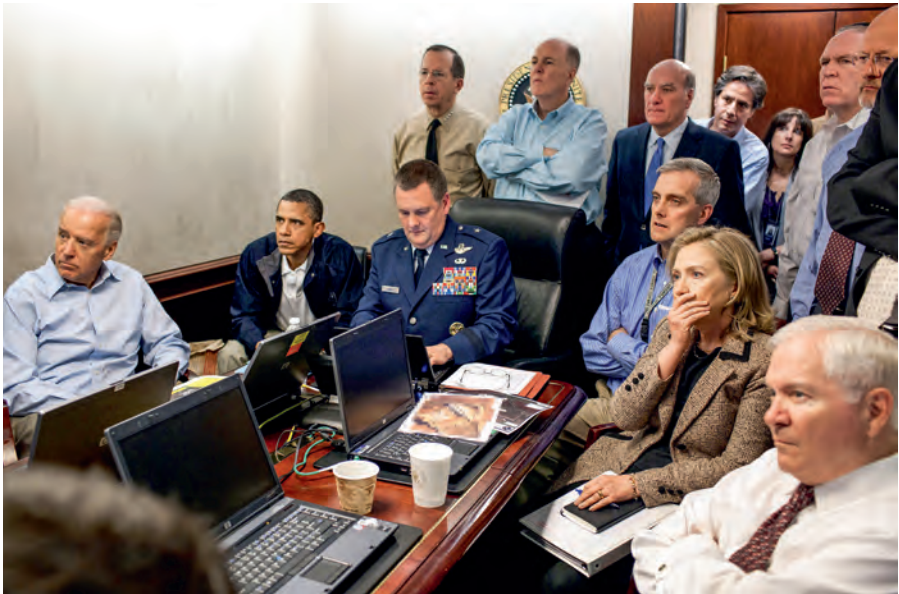
Things didn't look so good at that moment. The White House; May 1, 2011.