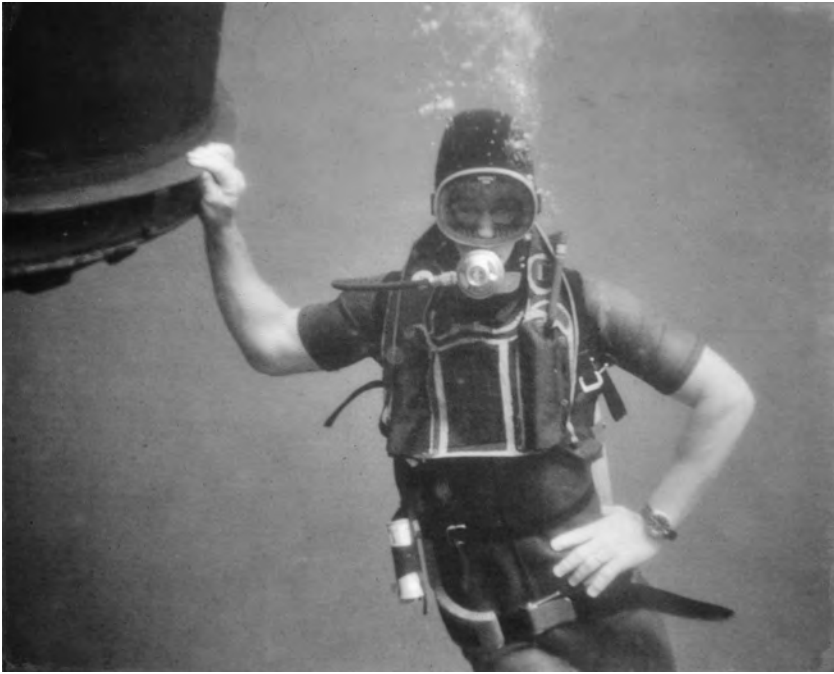
Hanging off the lock-out chamber of the USS Grayback . Philippines; 1979.