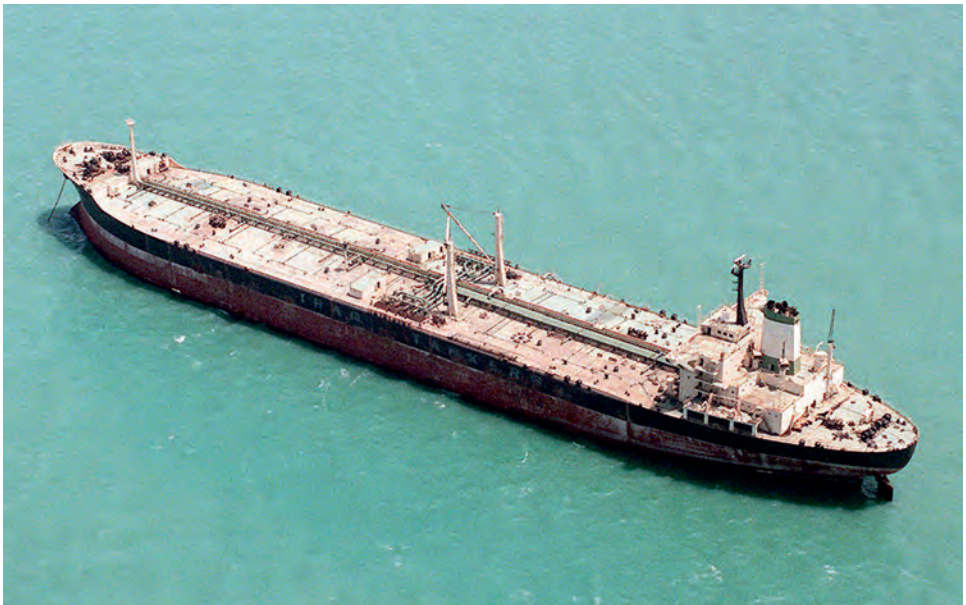
Iraqi tanker.