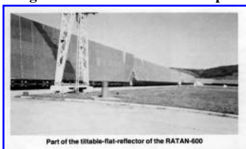
Part of the tiltable-flat-reflector of the RATAN-600