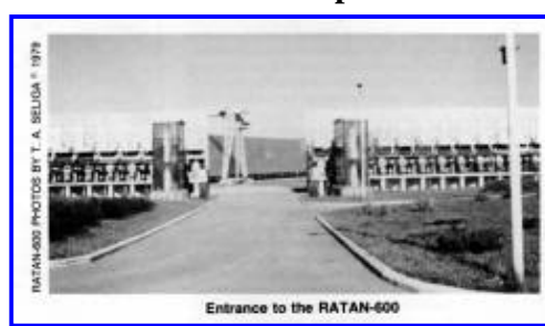
Entrance to the RATAN-600

Of course, not all scientists accept the notion that other advanced civilizations exist. A few who have speculated on this subject lately are asking: if extraterrestrial intelligence is abundant, why have we not already seen its manifestations? Think of the advances by our own technical civilization in the last 10,000 years, and imagine such advances continued over millions or billions of years. If any civilizations are that much more advanced than we, why have they not produced artifacts, devices and even cases of industrial pollution of such magnitude that we would have detected them? Why have these beings not restructured the entire Galaxy for their convenience?