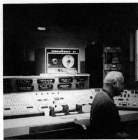
Veteran operator Ken Cottrell at the control console of the Green Bank 91-meter radio telescope