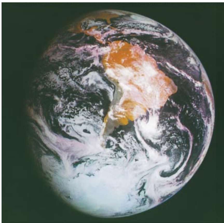
LIFE ON THE EARTH betrays its presence in images and measurements made by the Galileo spacecraft. This false-color infrared image reveals a mysterious red-absorbing pigment (chlorophyll, which appears orange-brown here) painting the continents. No such pigment is seen anywhere else in the solar system. Spectra indicate that the earth's atmosphere is unusually rich in molecular oxygen and methane. Galileo has boosted scientists' confidence that they may be able to spot the telltale signs of life even if it is different from life on the earth.

One experiment measured the gases exchanged between Martian surface samples and the local atmosphere in the presence of organic nutrients carried from the earth. A second experiment brought a wide variety of organic foodstuffs marked by a radioactive trac-